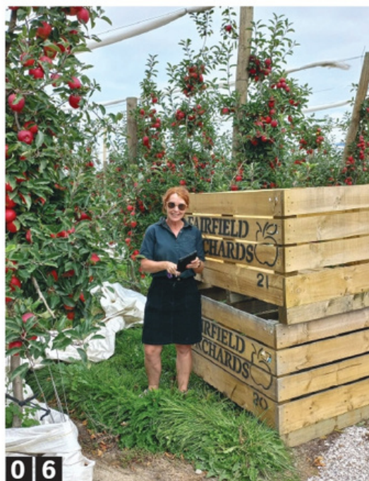
(PICTURE 01) The Hectre Orchard Management App in use at Fairfield Orchards